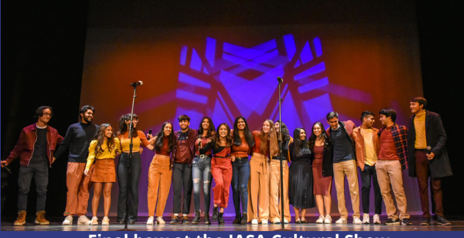
Final bow at the IASA Cultural Show